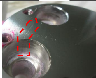
Example) Damaged Pressure Indicator Flange